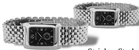
Stainless Steel with Quartz Movement $170