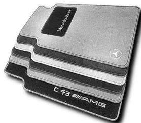
Velour Floor Mats $71 to $110