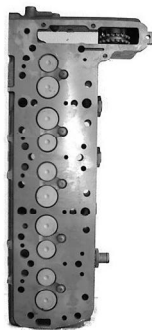
All MBZ Cylinder heads starting at $475.00

11315A Dismantle Court Rancho Cordova, CA 95742 (916)631-7300 Toll Free 1-800-783-4911