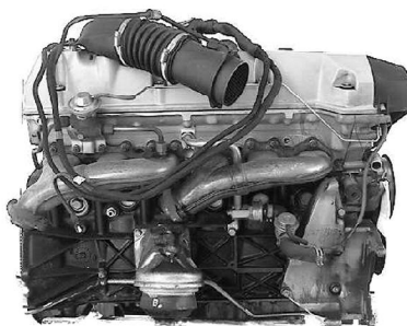
Engines 4 cyl diesel starting at $1950.00

Now available: reconditioned engines and rebuilt cylinder heads