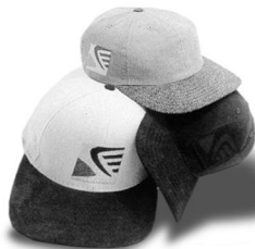
M-Class Cap 100% Cotton $18.50 to $20

Mercedes-Benz Center 1810 Howe Avenue Sacramento, CA 95825 (916) 924-8000