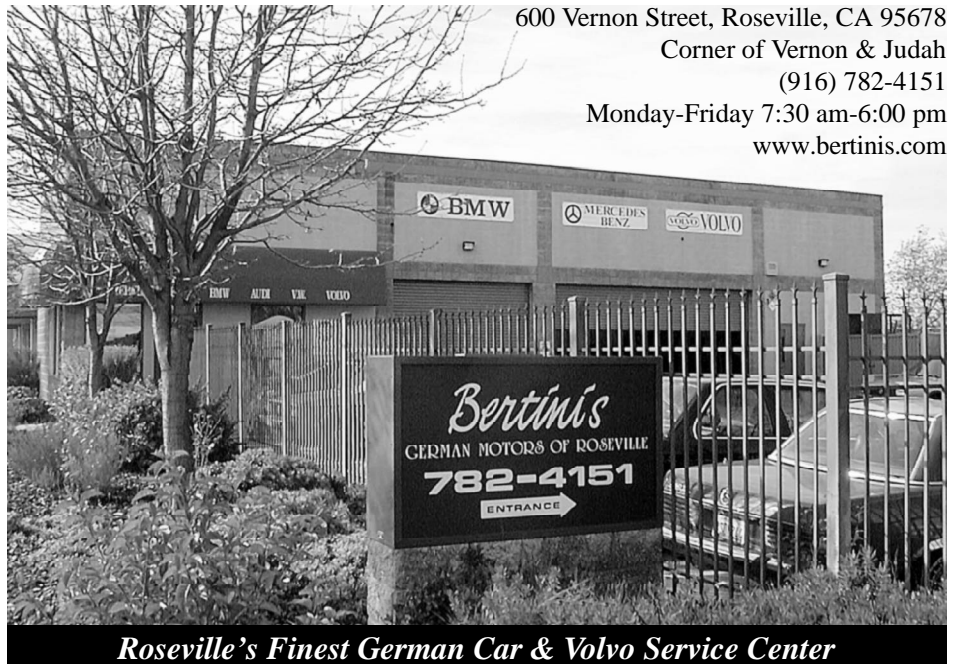
Roseville's Finest German Car & Volvo Service Center