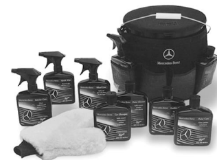
Car Care Kit $98