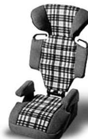
Child Booster $163

Parts Department is open to serve our clients Monday thru Friday from 7:30 am – 6:00 pm & Saturdays from 8:00 am – 5:00 pm