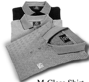
M-Class Shirt 100% Cotton Polos $68 to $74