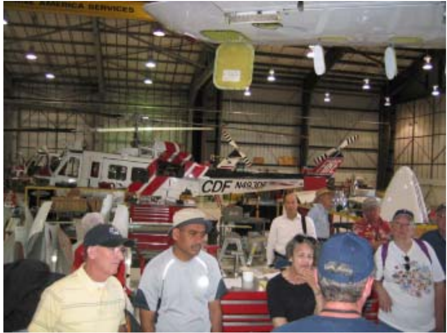
Sacramento Section Members At The CDF