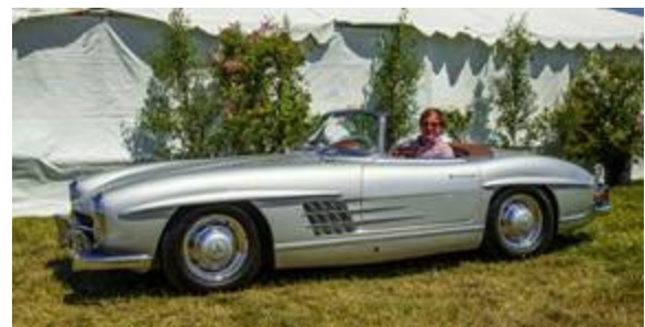
2014 Class Winner